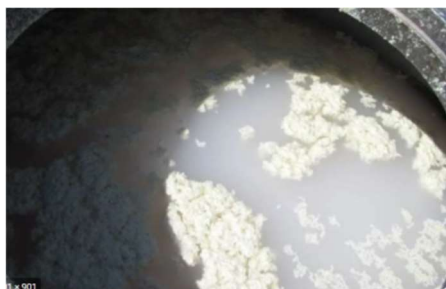
Fig.1 Chemical Incompatibility