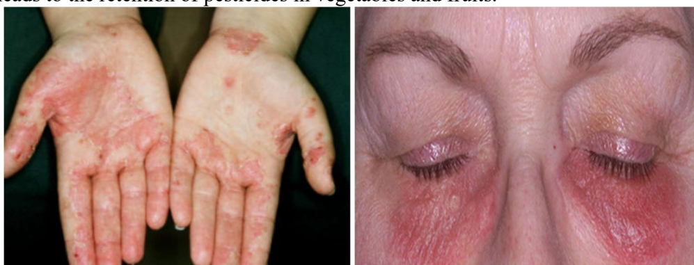
Fig.2&Fig.3 Health Issues

5) Combined effect: The tank mixes have a very adverse impact on human health. The "cocktail effect" leads to the retention of pesticides in vegetables and fruits.