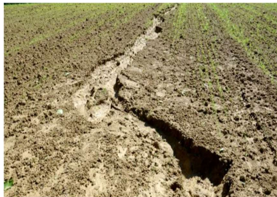
Fig.4 Soil Erosion

2) Water: Pesticides leached in the water by lixiviation in which the pesticides move into the soil it further penetrates to ground-level water, by superficial runoff in which the pesticides molecules moves with soil and water runoff or by spraying derivation i.e., the wind carries the molecules during pesticide spraying. They linked with the superficial and underground water contamination. Also, they may incorporate into drinking water and causes health issues too. Pesticides impact the aquatic ecosystem when they are used in larger quantities. Pesticides release chemicals such as copper sulphate which kills fishes and other water animals.